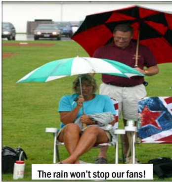
The rain won't stop our fans!