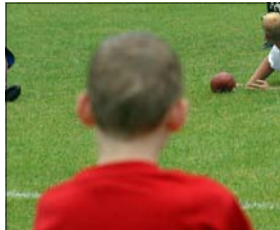
Let's never forget There are eyes watching us