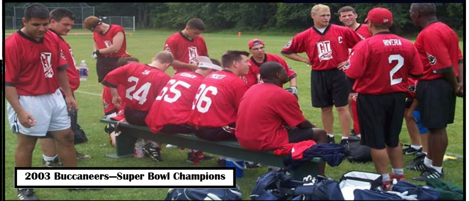
2003 Buccaneers—Super Bowl Champions

To introduce men and their families, to the true Jesus Christ , in hopes that all that are called will enter into a real relationship with Him.