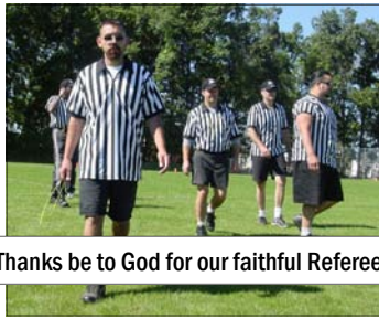
Thanks be to God for our faithful Referees!